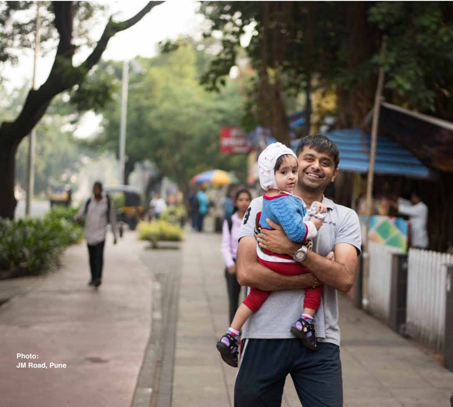
Photo: JM Road, Pune

The documents reviewed in this report include policies, guidelines, and plans that have an impact on ITC mobility. Cross-departmental collaboration is a key requirement in order to achieve ITC-friendly cities, hence documents from all urban mobility related domains have been selected for the assessment. The selected documents range from Comprehensive Mobility Plans, to parking policies, and street design guidelines. To review state and city level documents, the state of Maharashtra and the city of Pune were selected.