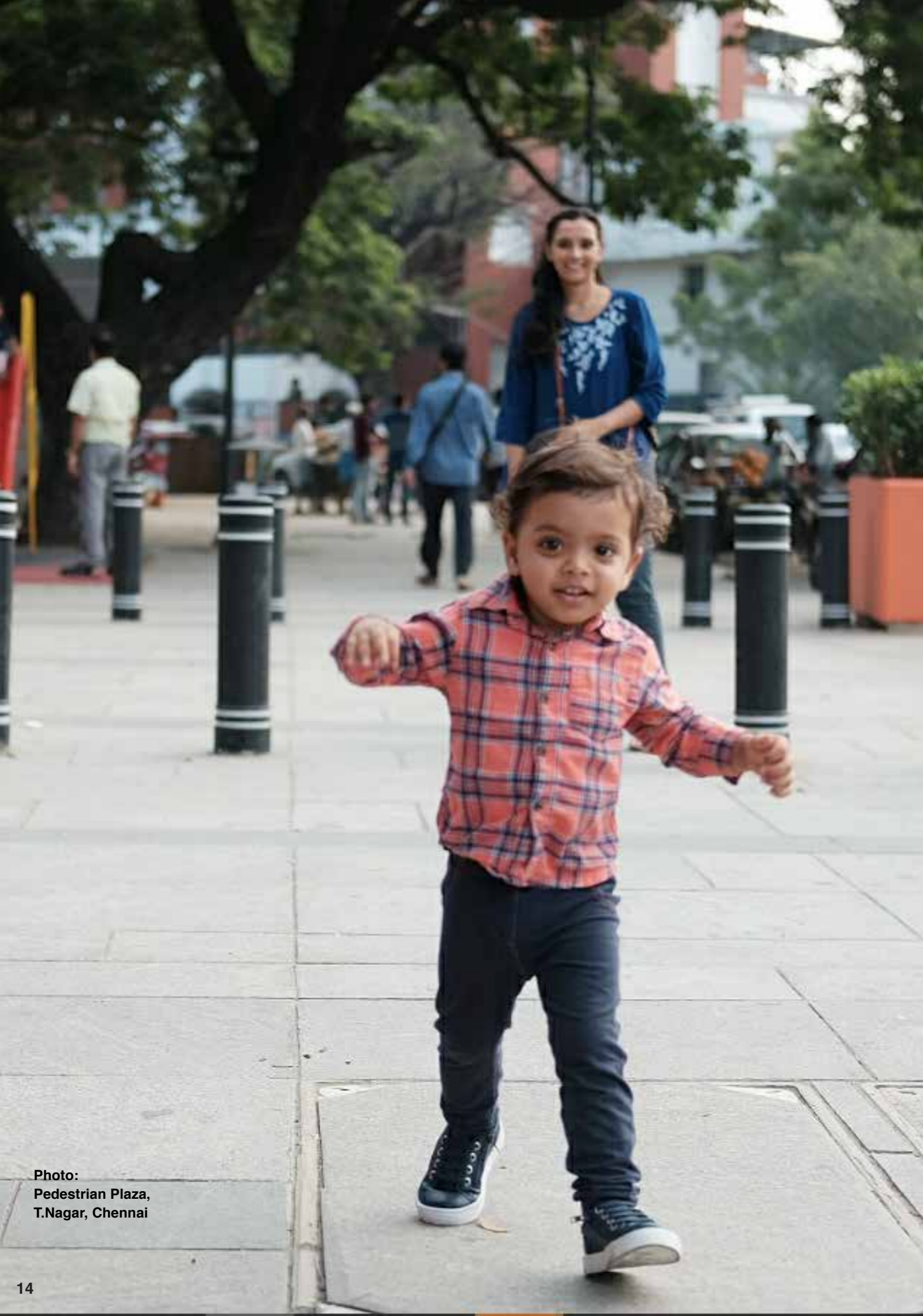
Photo: Pedestrian Plaza, T.Nagar, Chennai