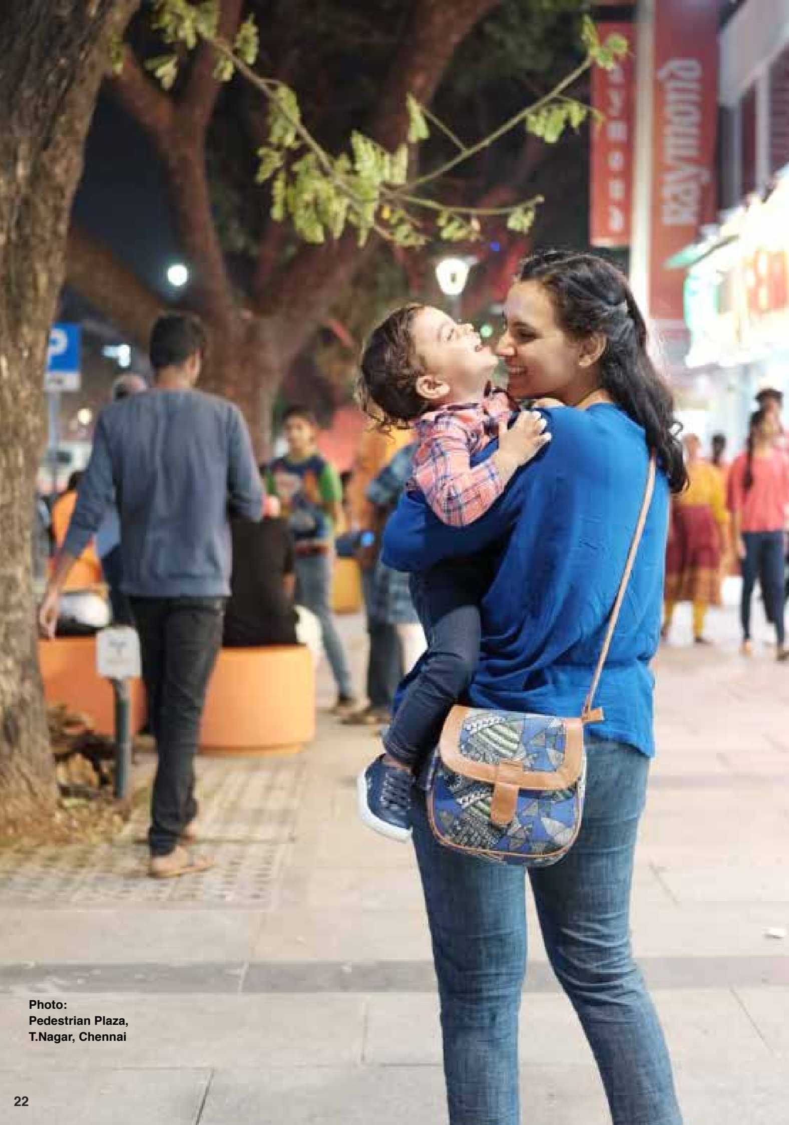
Photo: Pedestrian Plaza, T.Nagar, Chennai