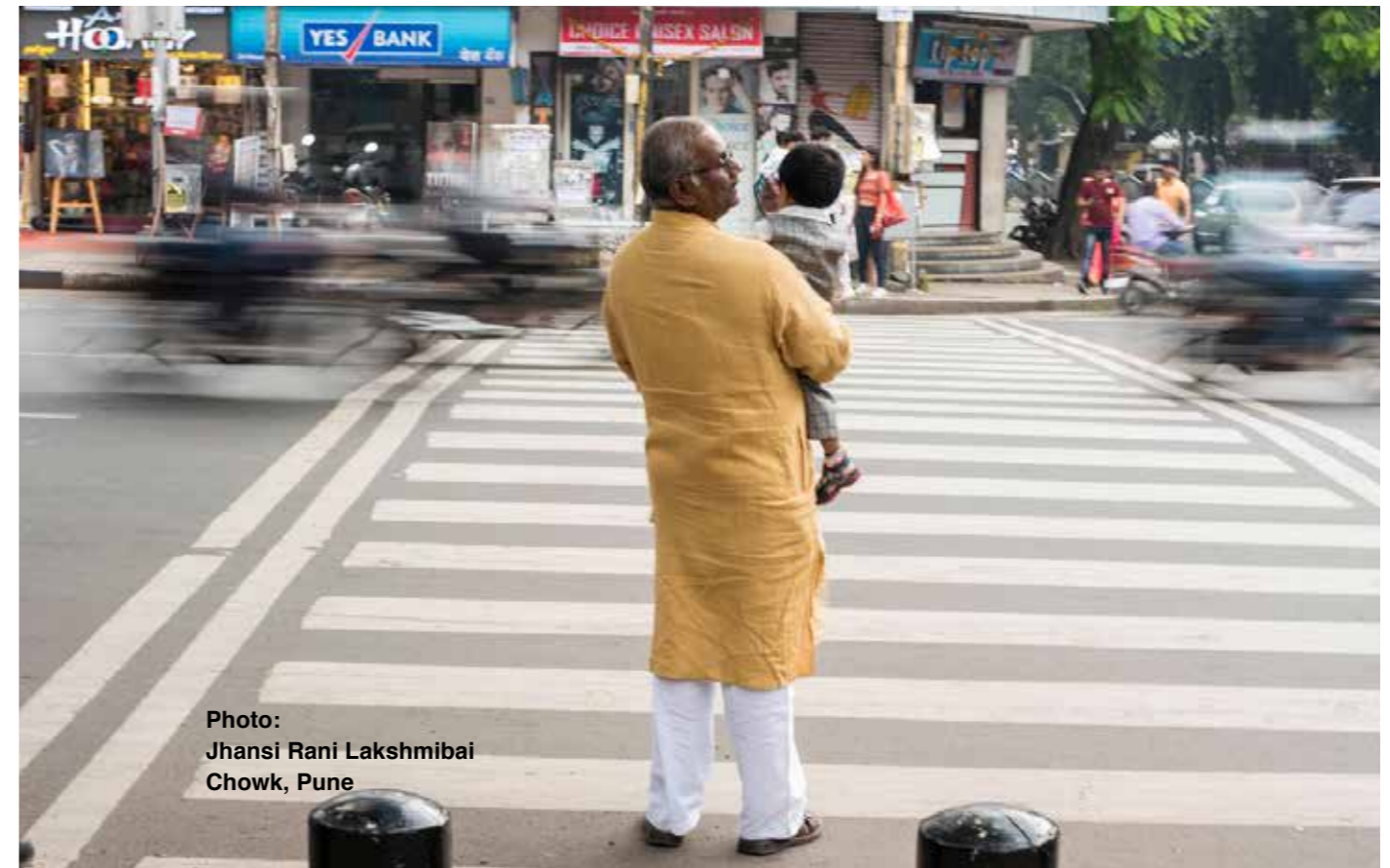
Photo: Jhansi Rani Lakshmibai Chowk, Pune

Most streets in Indian cities prioritise automobiles and are designed around the scale of an able-bodied male adult. The lack of pedestrian facilities such as properly designed footpaths, pedestrian crossings, street lights, adequate shading combined with unreliable and unsafe public transport have deprived our young children and their caregivers safe access to the city. This is because most caregivers in our cities are either women or older people who use public and non-motorised modes of transport. Designing cities primarily for able-bodied men who own private vehicles deprives young children and caregivers of their mobility needs.