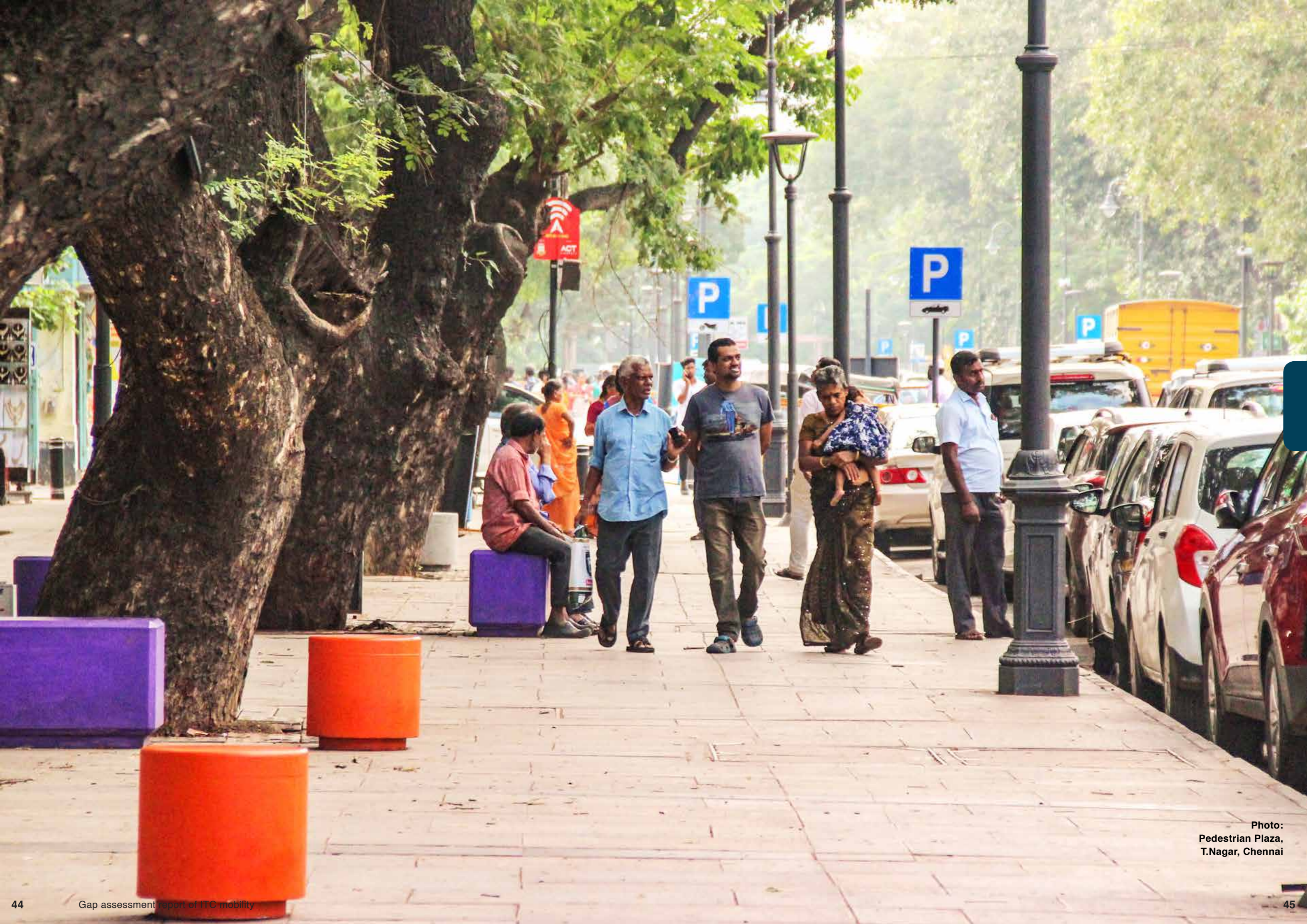
Photo: Pedestrian Plaza, T.Nagar, Chennai