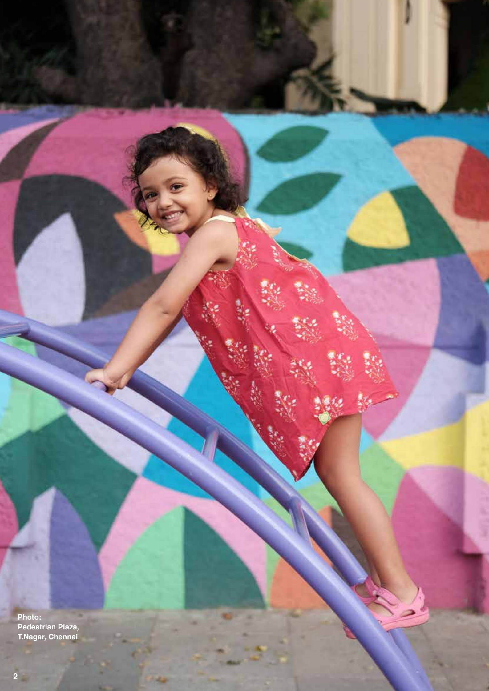
Photo: Pedestrian Plaza, T.Nagar, Chennai