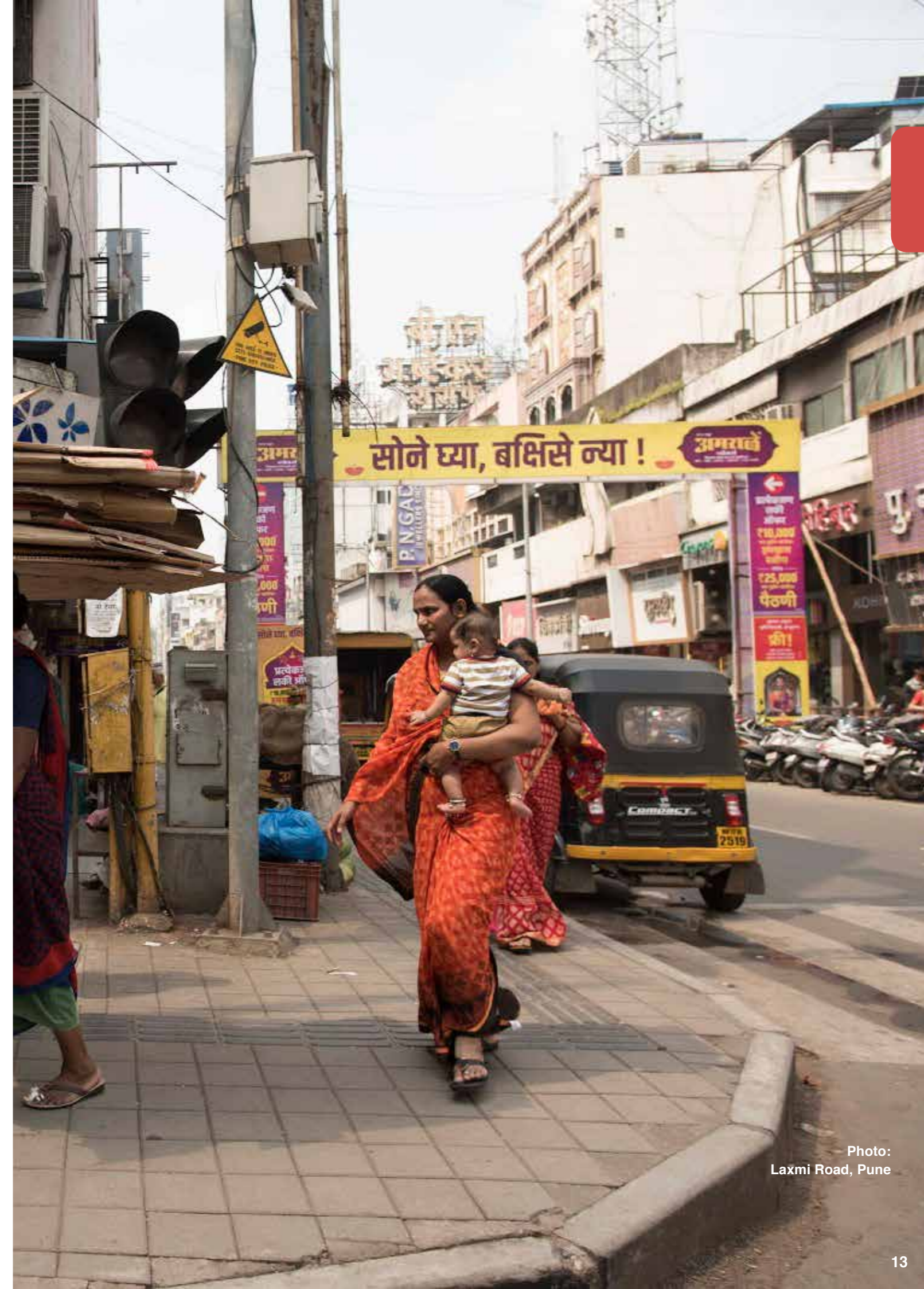
Photo: Laxmi Road, Pune