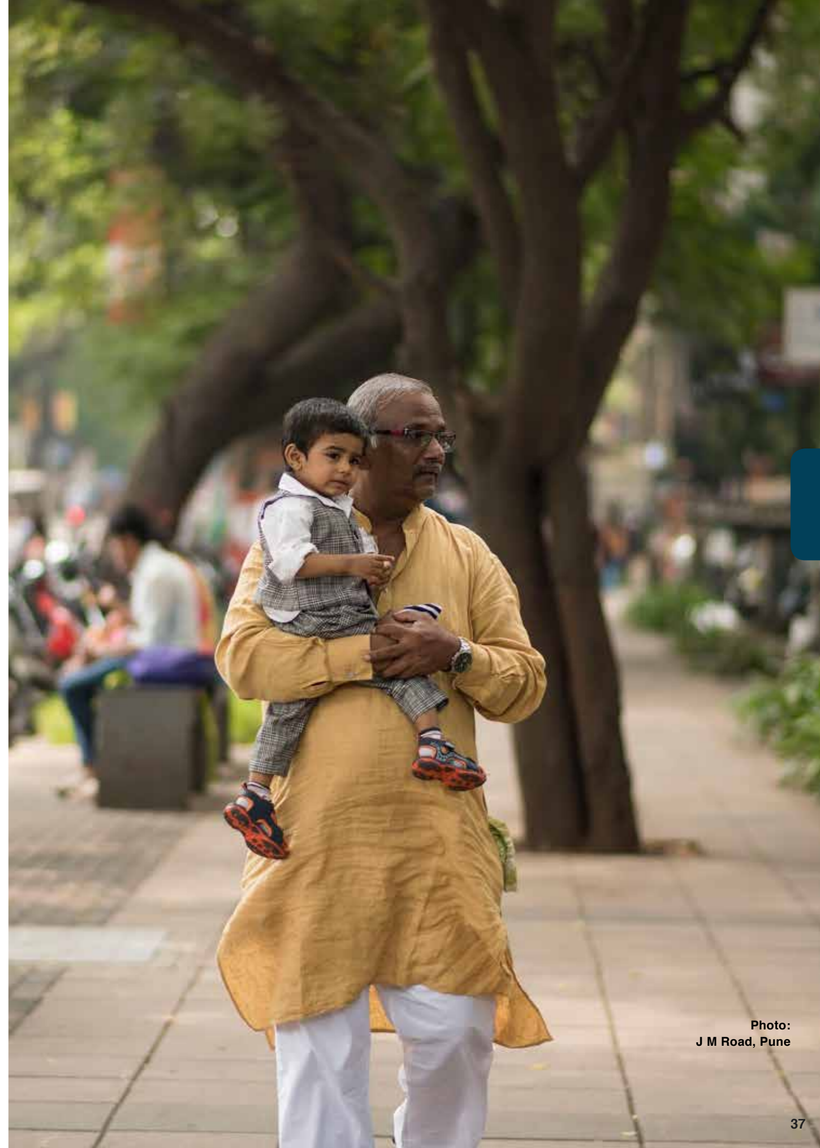
Photo: J M Road, Pune