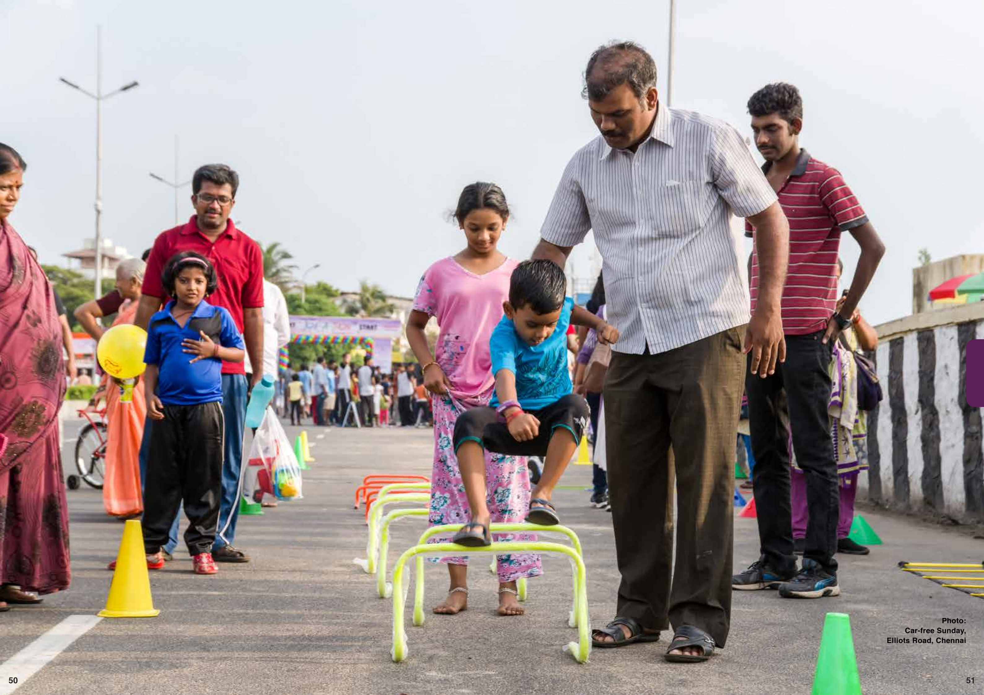
Photo: Car-free Sunday, Elliots Road, Chennai