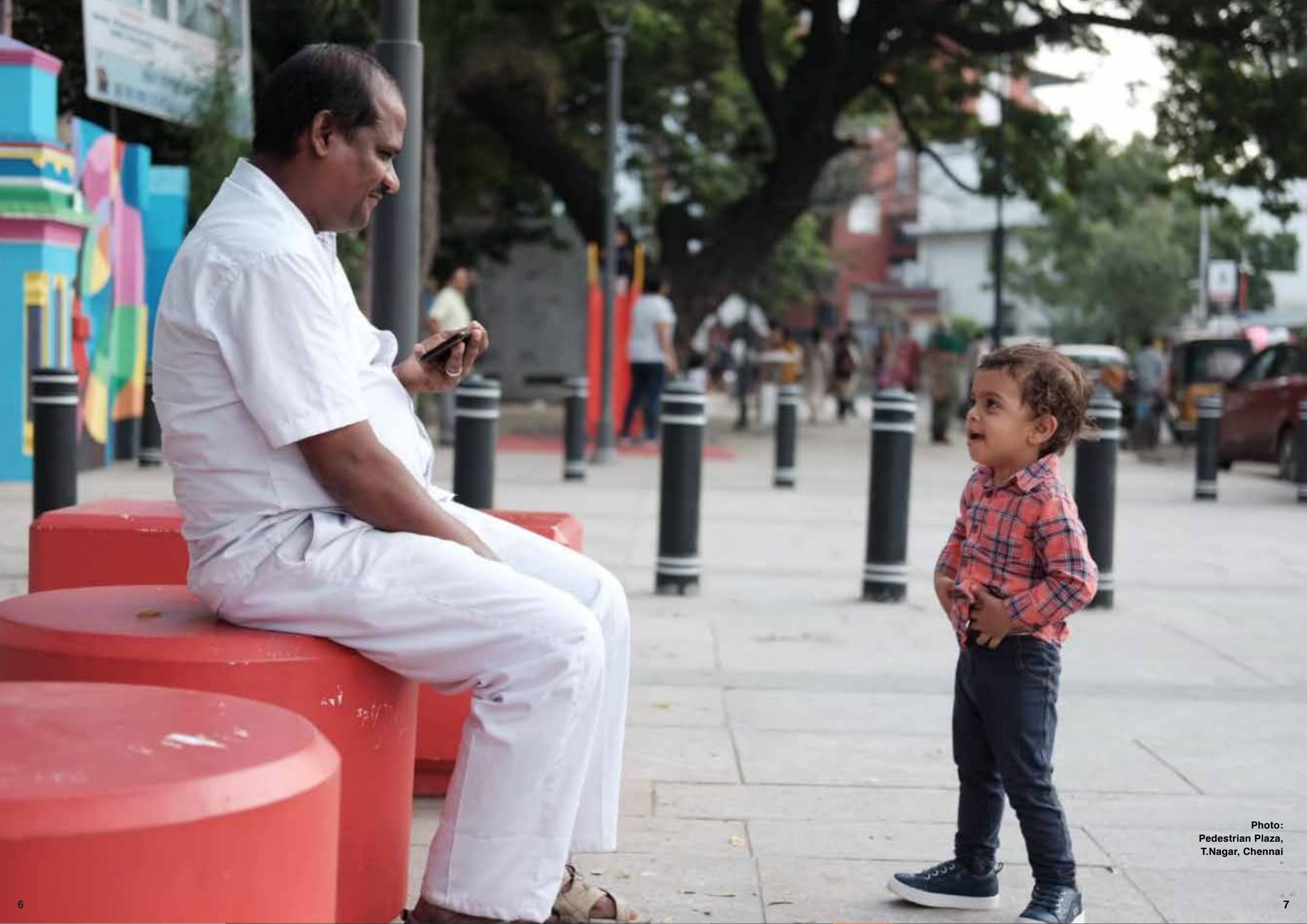
Photo: Pedestrian Plaza, T.Nagar, Chennai