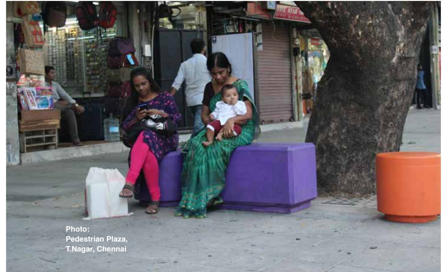
Photo: Pedestrian Plaza, T.Nagar, Chennai

The final output of the comprehensive gap assessment can be summed up as: