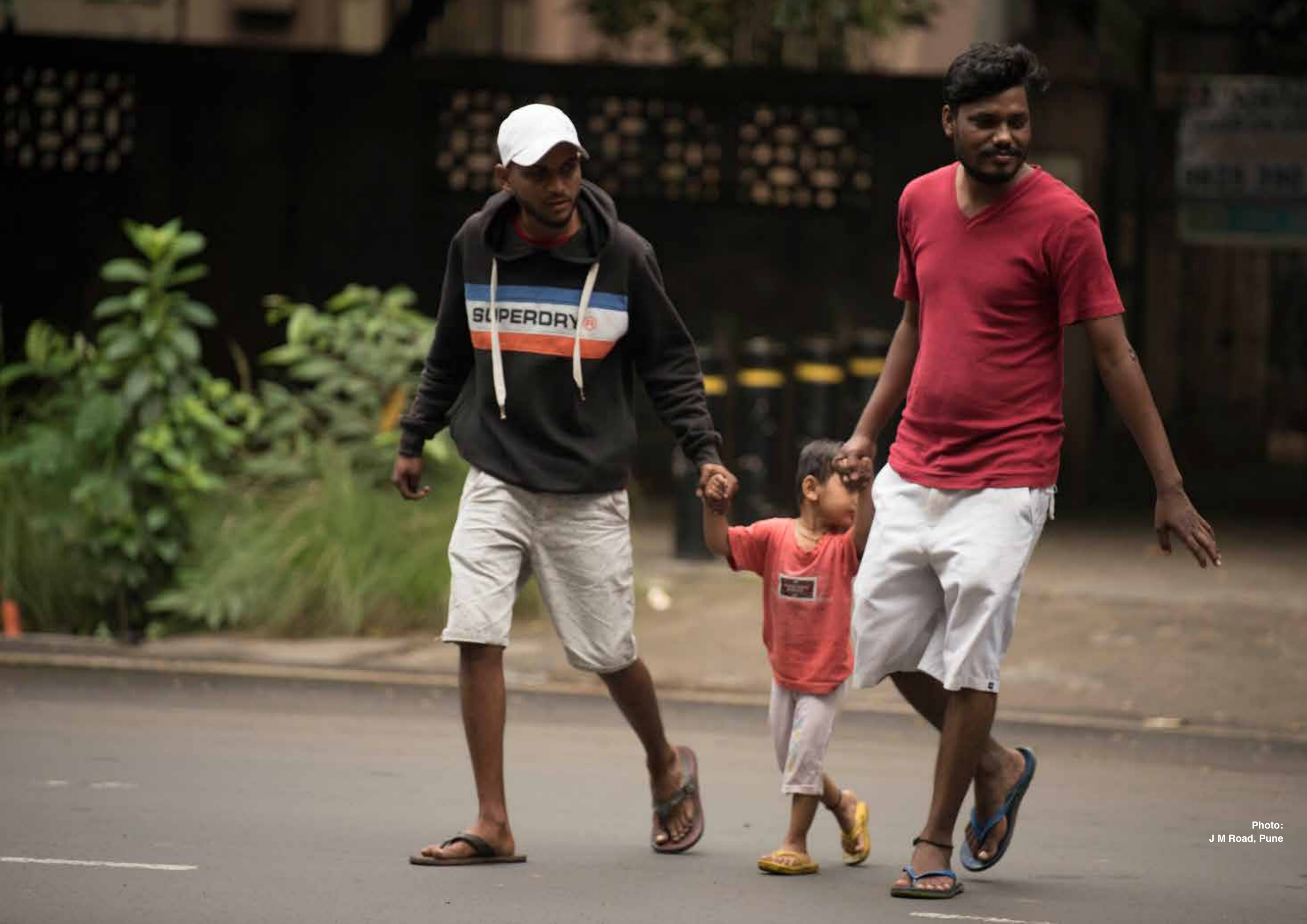
Photo: J M Road, Pune